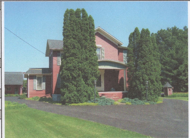
2015 FRONT VIEW