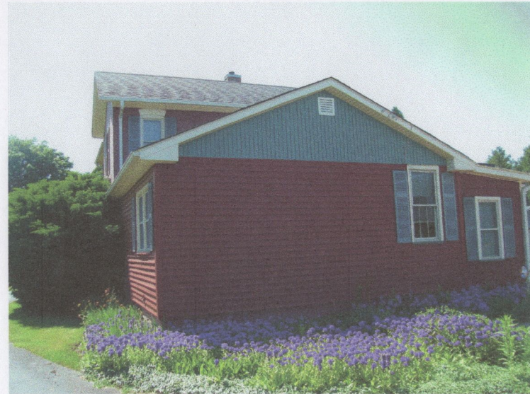
2015 REAR VIEW