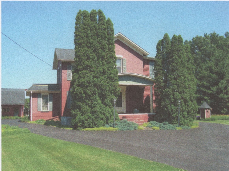
2015 FRONT VIEW