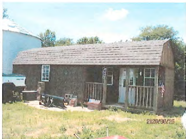
SHED ON SKIDS -1