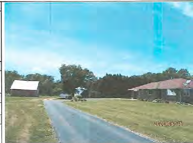
1 STRY HOUSE BLDGS-Default