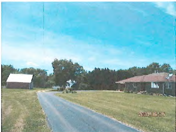
1 STRY HOUSE BLDGS