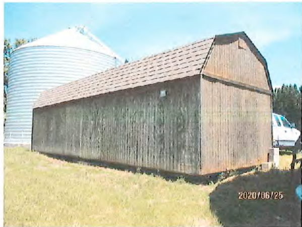
SHED ON SKIDS